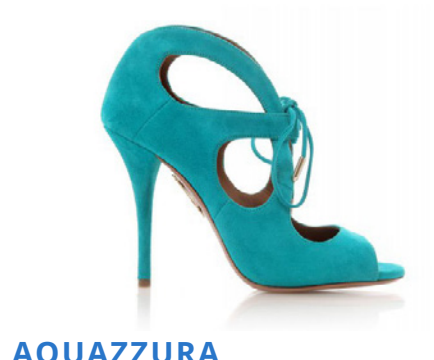
AQUAZZURA VALE C'est Chic Metalli