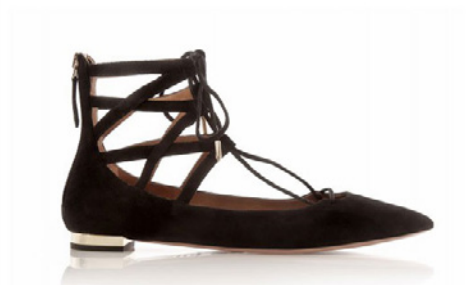
AQUAZZURA Belgravia Flat