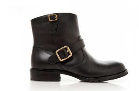
MARC BY MARC JACOBS Motorcycle Boot