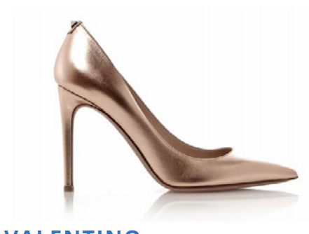
VALENTINO Metallic Leather Pump