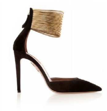
AQUAZZURA Hello Lover